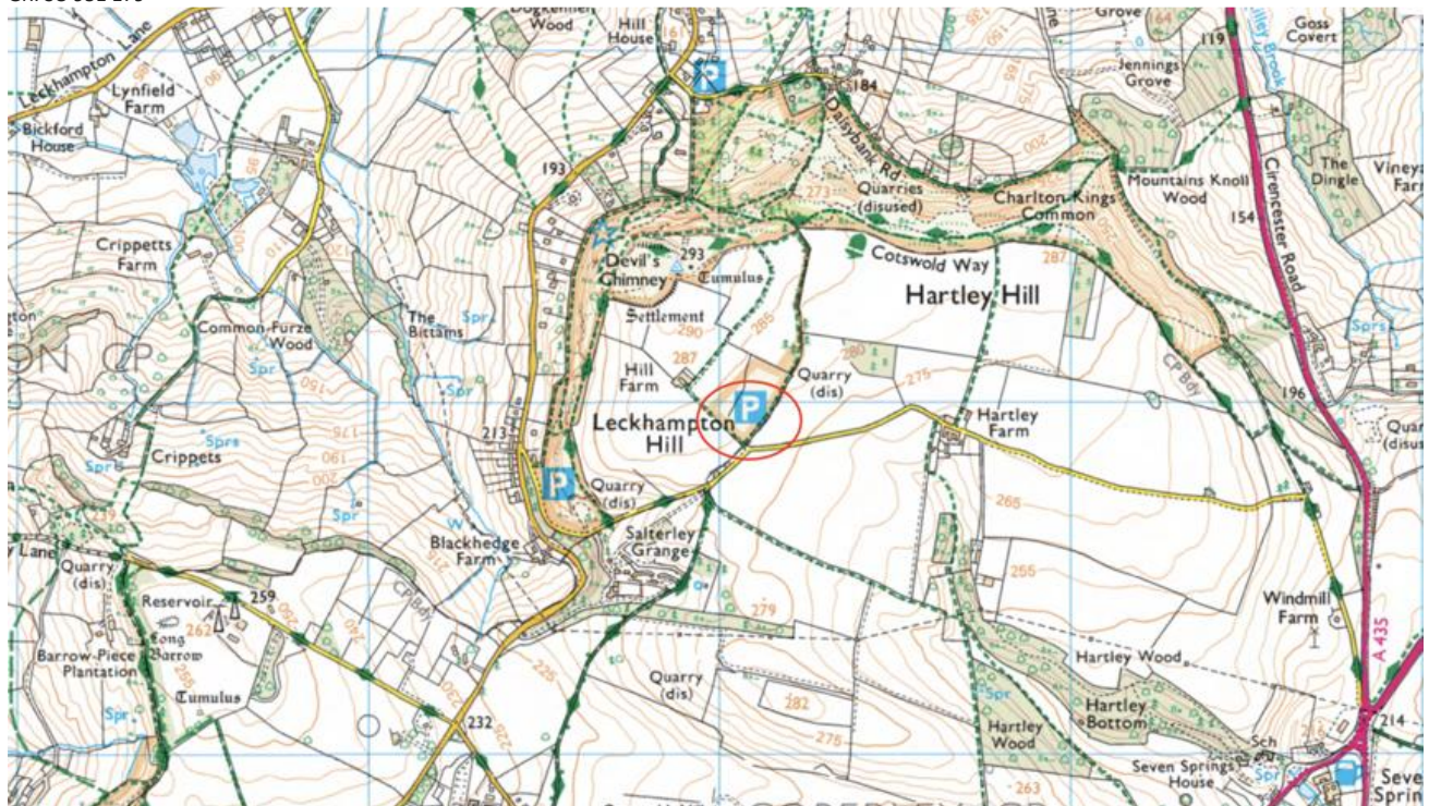
OS Map for Brownstone Quarry Car Park